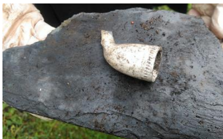
The bowl of a clay smoking pipe was found in the debris.

The tirfor was used to slowly pull the stump away from the wall. Trust land management continued carefully removing the stumps from the dig area so that the area is clear for LIHS to continue excavating the cottages.