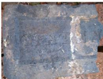
A brick with letters.