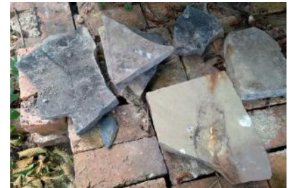
Thick flat stone slabs, possibly from the fire area.