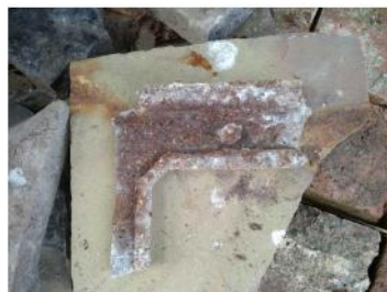
A metal corner.